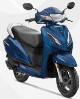
Decent Blue Metallic