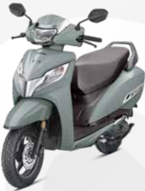
Pearl Deep Ground Gray