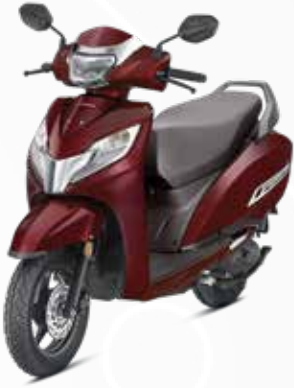
Rebel Red Metallic

Mascot Motors Gandhi grain market, 38/39, Telephone exchange Square, central avenue New Delhi INDIA REG. NO. 103 MO. 9811009207