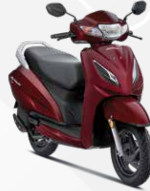
Rebel Red Metallic